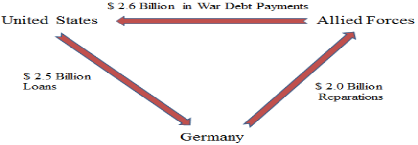
Figure 1: The 1923-24 Dawes Economic Assistance Plan

Hence, it can be argued that the Pax-Americana, constructed in the post WW-II era, is on the collapsing trajectory due to the highly upsetting internal and external challenges to Washington. 30