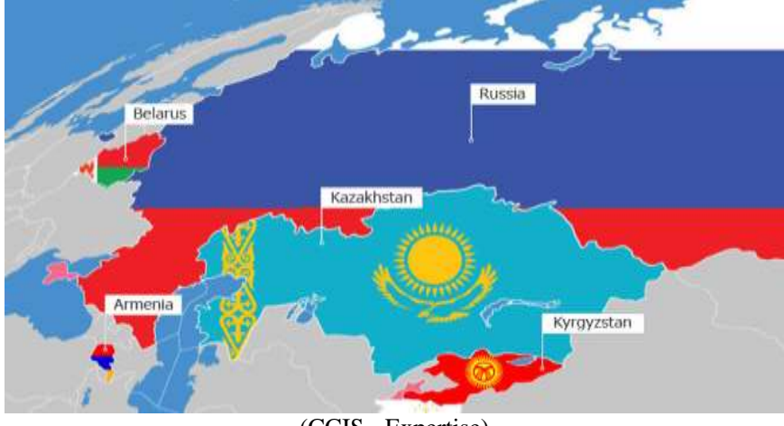
Map 2. Showing Eurasian Economic Union Region.