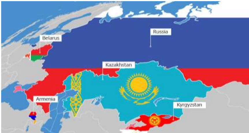
Map 2. Showing Eurasian Economic Union Region.

(Eurasian Economic Union). In 2000, the EEC (Eurasian Economic Community) was founded, that comprised of Tajikistan, Kyrgyzstan, Kazakhstan, Belarus and Russia. All these countries were the descendants of Central Asian Economic Cooperation Organization. In 2010, the CU was announced (which was known as close regionalism), SCO in 2001 and in 2002 the CSTO was announced. In 2012, the Eurasian Economic Union was announced; the contemporary Russian integration plan for the region. On 1 st January, 2015 the EAEU that included Kyrgyzstan, Kazakhstan, Belarus, Armenia and Russia replaced the Eurasian Economic Community (Map 2). Tajikistan joining the Eurasian economic union has yet to happen. 26