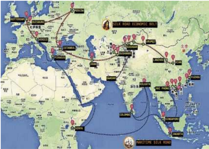
Map 3. Showing BRI, SREB, MSR routes.

There are two components of BRI such as Silk Road Economic Belt (SREB) and 21 st century Maritime Silk Road (MSR) (Map 3). The 21st century MSR is an extension of Eastern ports of China and via South China Sea-Strait of Malacca-Indian Ocean-Persian Gulf and up to Europe via Suez Canal. 36